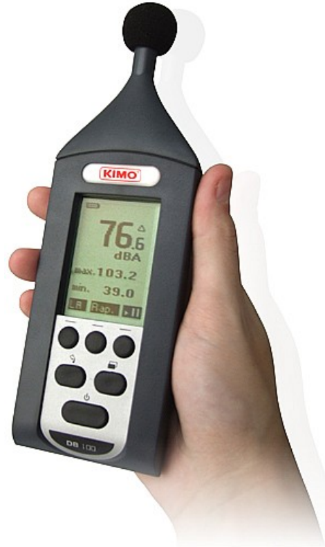
*Livré avec écran anti-vent