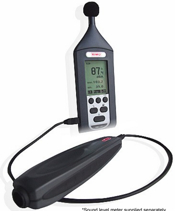
*Sound level meter supplied separately