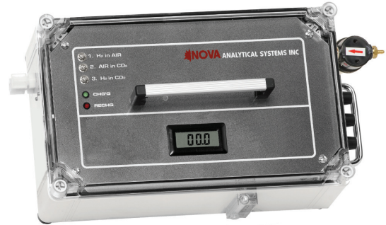
Weatherproof (WP) Enclosure