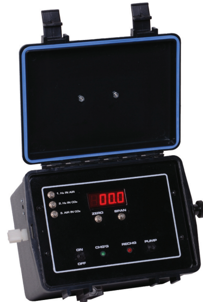
Suitcase (K) Enclosure